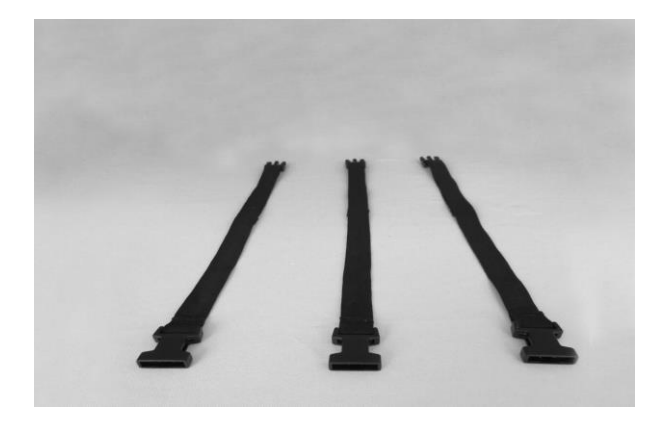
Pic. 3: Attach the 5 short straps to the clip on the side of the car.

Pic. 1: Lay out the 3 long belts where the vehicle is to end up. Then drive the vehicle directly over the belts.