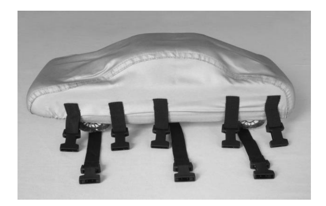
Pic. 4: Pass the 5 short straps under the vehicle and snap them into the clips on the opposite side.

Pic. 2: Now cover the vehicle with the covers supplied.