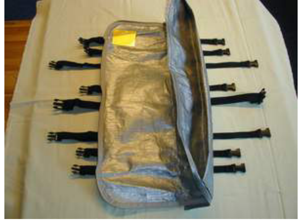
Pic 2: Unfold PermaBag over the straps