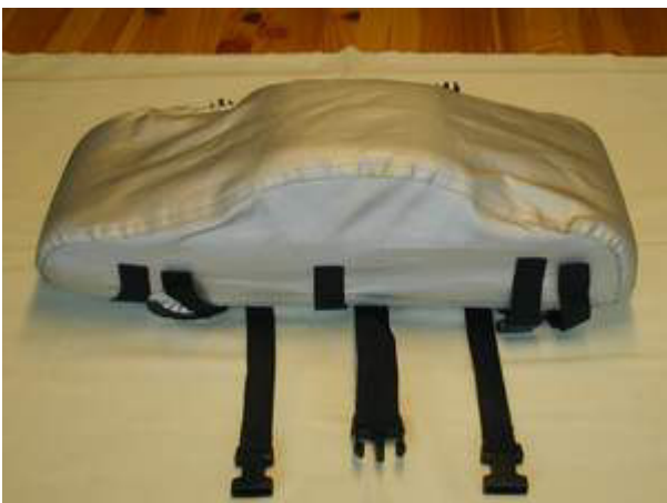
Pic 5: Place the Silver Cover on to the car