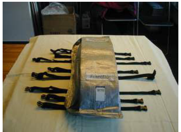
Pic 4: Place the Hygrometer and PermaPack-cylinders in to the PermaBag and close the zip