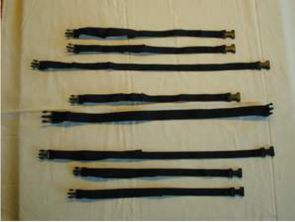
Pic 1: Lay out the security straps (3 long + 5 short)