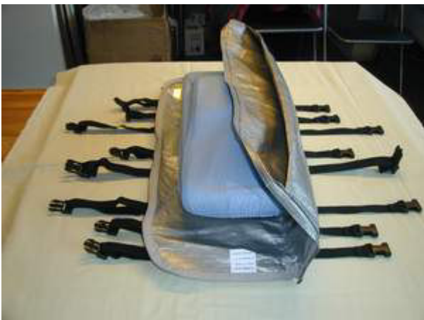
Pic 4: Place the Hygrometer and PermaPack-cylinders in to the PermaBag and close the zip